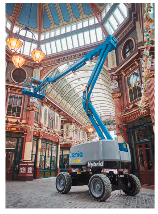
660lb/300kg Capacity Jib