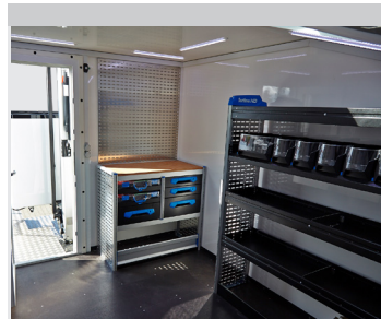
Workshop interior (optional)