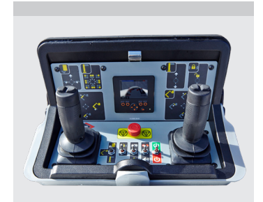
FPC (Full Proportional CANbus controls): Up to 4 simultaneous actions (2 per joystick)