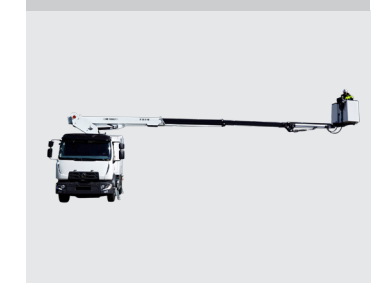
Turret/knuckle tail swing and outriggers within the mirrors