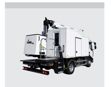
Workshop module for the chassis (optional)

Home function & limited working area without outriggers