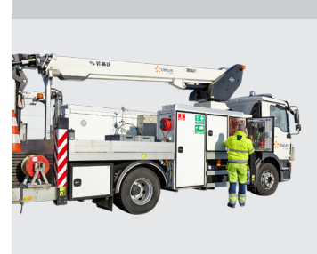
Cabinets for the chassis (optional)