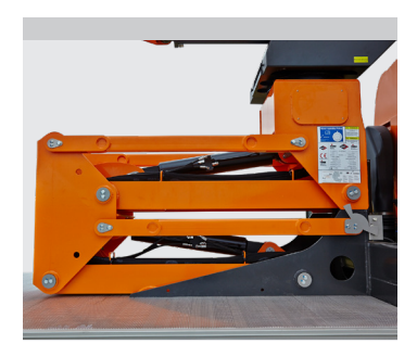
Hydraulic lift elevator (3 m)