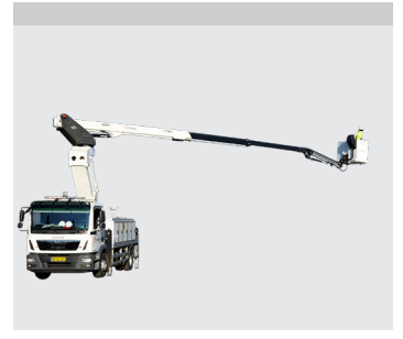
Reach worksites "up and over" obstacles

Load cell (Variable load dependant outreach) Home function & limited working area without outriggers