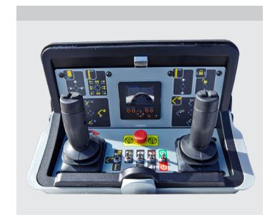
FPC (Full Proportional CANbus controls): Variable outreach (with load cell) and up to 4 actions at a time