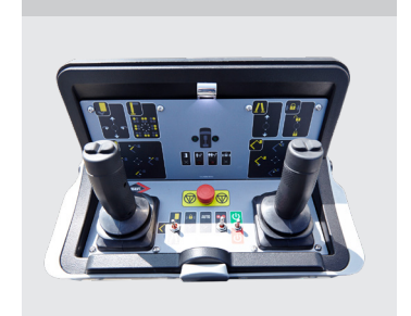
LMC (Load Moment Controls): Variable outreach and up to 2 actions at a time (1 per joystick)