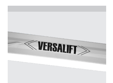
The shaped profile ultra high strength steel booms provide improved rigidity, stiffness and performance

Workshop interior LED ceiling lights in the van Outrigger pads with holders Amber LED beacon(s) on the roof Inverter Bucket rotator (2 x 90°) Display in the upper control panel Limited working area without outriggers