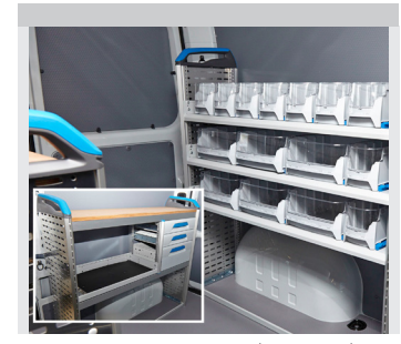
Workshop interior (optional)