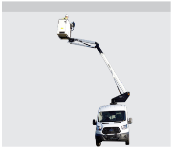
Turret/knuckle tail swing and outriggers within the mirrors