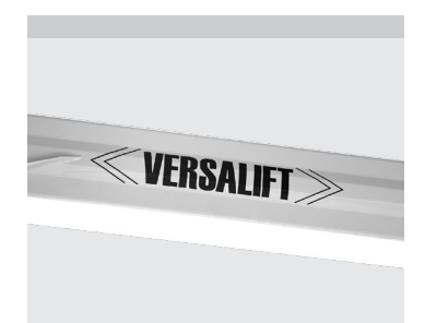
The shaped profile ultra high strength steel booms provide improved rigidity, stiffness and performance

Workshop interior LED ceiling lights (in the load area) Tow bar Safety stripes (red/white) Removable LED spotlight Bucket rotator (2 x 90°) Display in the upper control panel Limited working area without outriggers