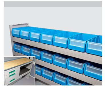
Workshop interior (optional)