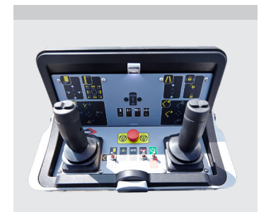
LMC (Load Moment Controls): Variable outreach and up to 2 actions at a time (1 per joystick)