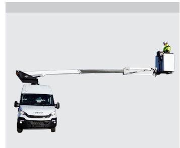
Turret/knuckle tail swing and outriggers within the mirrors