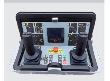
FPC (Full Proportional CANbus): Variable outreach, up to 4 simultaneous actions and home function