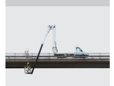
Ability to work below ground level (-3,3 meters)