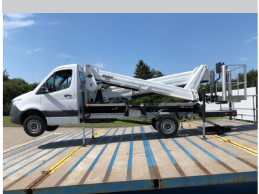
6° leveling depending on vehicle position