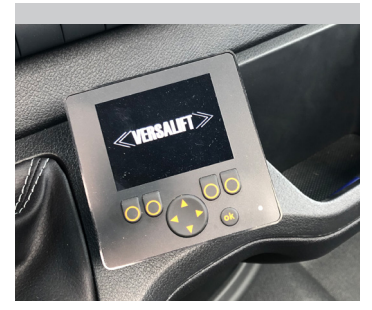
Userfriendly display in the cabin