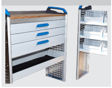
Workshop interior (optional)