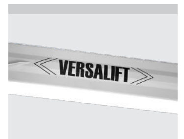
The shaped profile ultra high strength steel booms provide improved rigidity, stiffness and performance