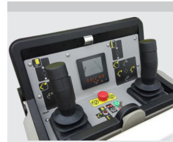
LMC (Load Moment Controls): Variable outreach and up to 2 actions at a time (1 per joystick)