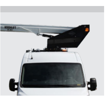
Turret/knuckle tail swing and outriggers within the mirrors